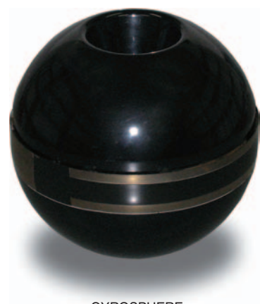
GYROSPHERE (MKT 007) is incorporated in MASTER COMPASS.

Serial data output IEC 61162-1 or -2 (high-speed transmission) is selective, and contains the ship's heading and rate of turn (ROT) information.